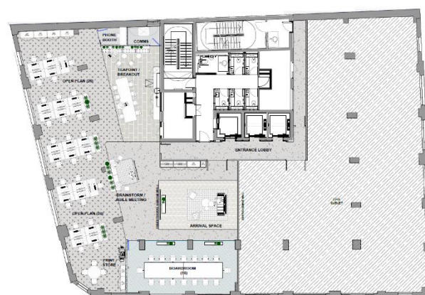
Proposed Cat B – Part Floor