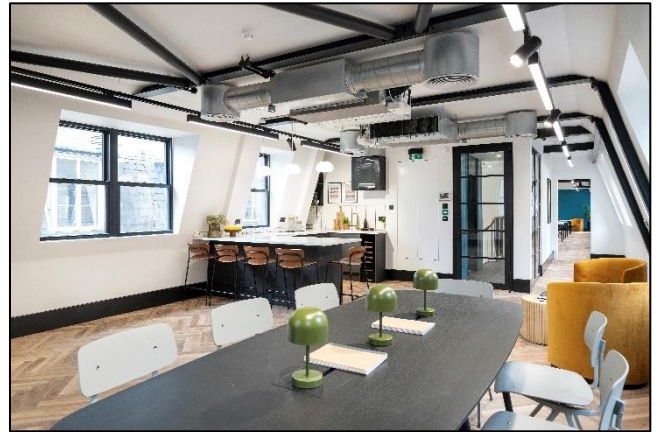
4 th Floor Layout