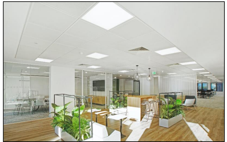
Indicative 3 rd Floor – 5,231 sq. ft.