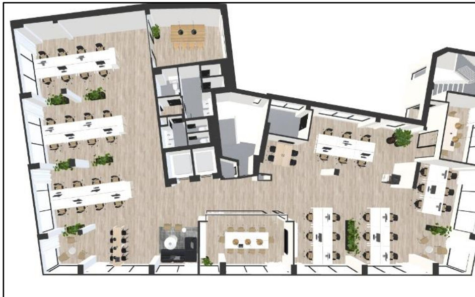
4 th Floor Layout